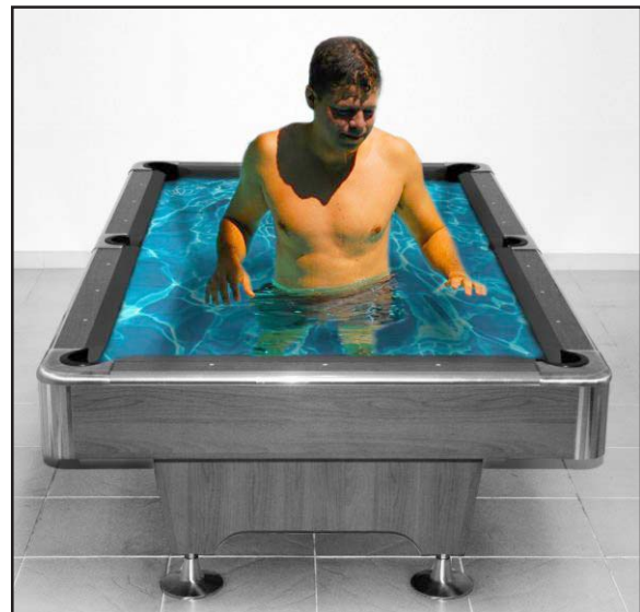
Swimming Pool anyone?