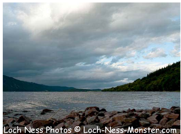
Loch Ness Photos © Loch-Ness-Monster.com

If you do not take breakfast at a bed-and-breakfast, is it really a B & B? We were all up and out by the time owlish Mrs. MacTavish got around to heating up the oatmeal. In the gloom and dank of a very dark Scottish morning we all boarded Angus MacQuarrie's boat for the swim across Loch Ness to Urquhart Castle, a ruin on the north side of the Loch. MacQuarrie, our grumpy pilot insisted that if we waited until daylight the boat traffic would make our swim impossible, so here we were in the wee hours of the morning, the only boat on the Loch. Into the Loch we all jumped, including Leo Lake, Chuck's teenaged son. (Today Leo is an officer in the U S Coast Guard, a recent Academy graduate.)